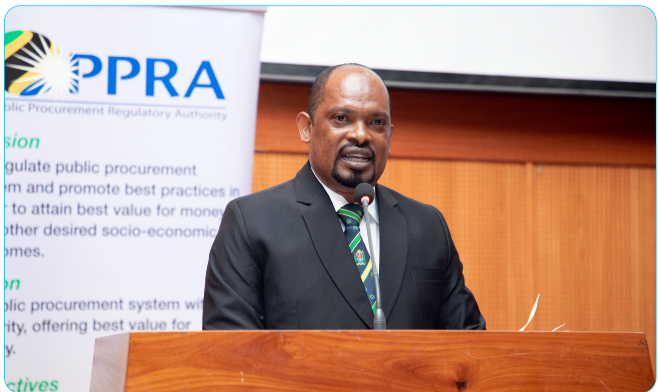
Deputy Minister for Finance Hamad H. Chande

From October 1, 2023 all procurement processes will be conducted through the new e-procurement system named NeST, which can be accessed through www.nest.go.tz